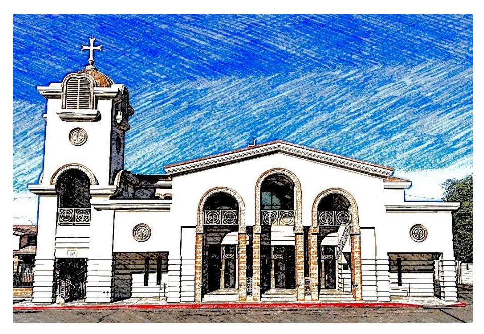
February 18th, 2024 Sunday of the Canaanite